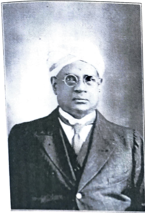
Sir P. S. Sivaswami Aiyar K.C.S.I. C.I.E.